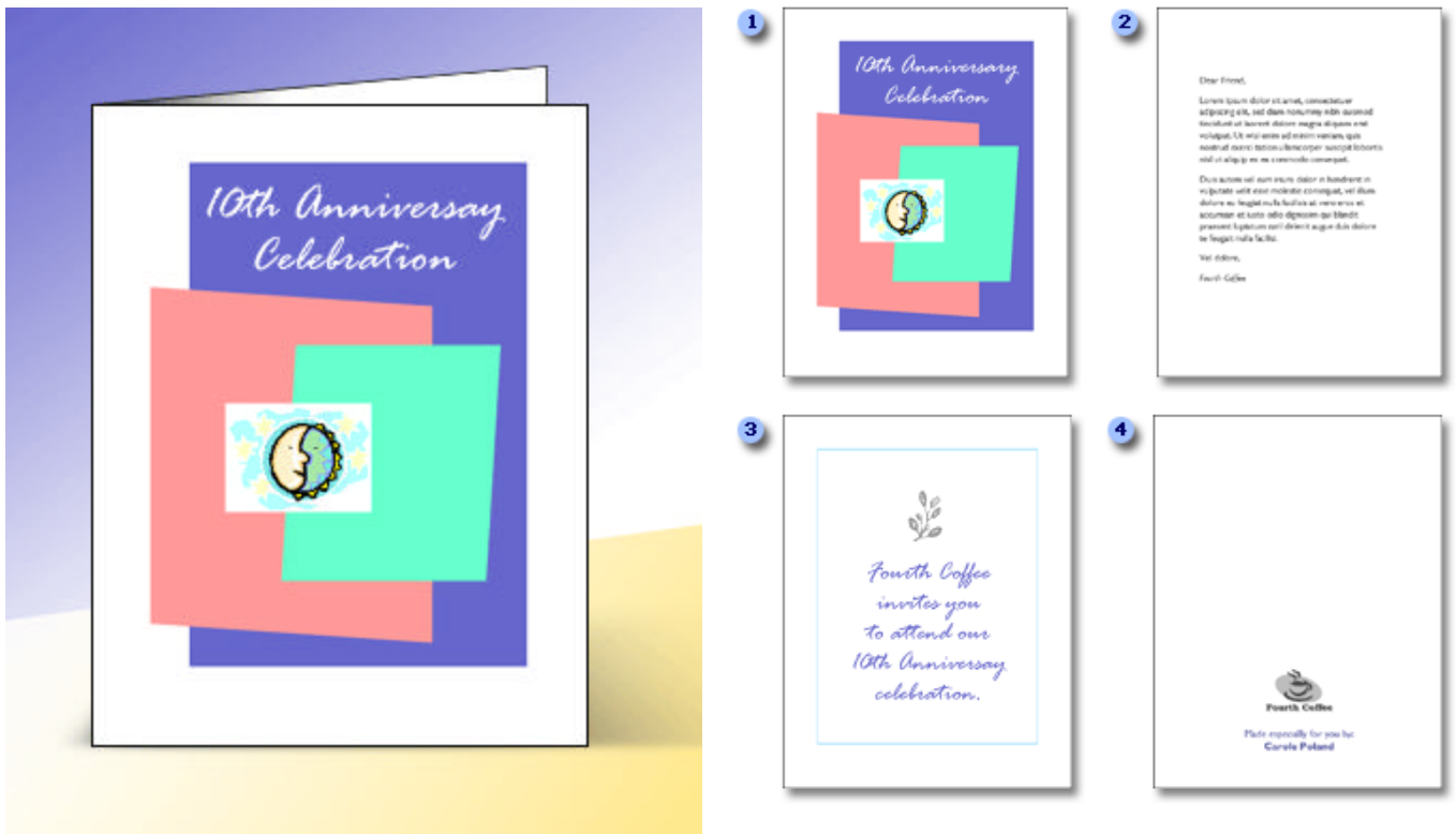
1 Front of card